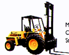
M Series forklifts Capacity: 6,000 - 30,000 lb Straight Mast 2WD, 4WD