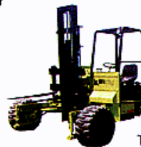
Tag-A-Long forklift Model LKTAS Truck Mounted forklifts