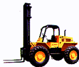
P Series forklifts 4WD, 4WS Capacity: 6,000 - 50,000 lb (2,727 - 22,675 kg)

7135 Islington Avenue Woodbridge, Ontario Canada L4L 1V9 Tel: (905) 851-3988 Fax: (905) 851-6396 info@liftking.com www.liftking.com Toll Free: 1 888 LIFTKING